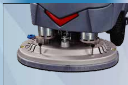
UP TO 200LB OF PAD PRESSURE

Downtime is wasted time. Money spent on replacement parts takes away from your bottom line. At ICE, we understand that you use our machines as hard as possible to do your job, and we recognize that sometimes maintenance is a necessity. That's why our auto scrubbers and cord electric equipment come with a 5 year warranty . We have faith that we put out the best equipment possible, but if anything happens, we're here for you.