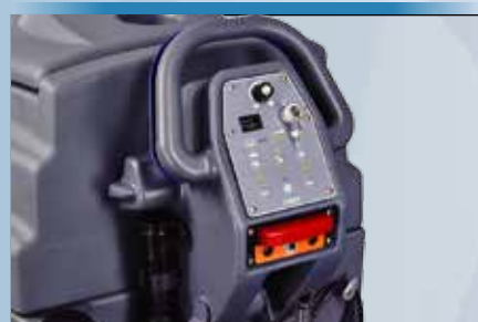
STATE-OF-THE-ART TOUCH PANEL CONTROL SYSTEM