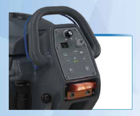
EMERGENCY SHUTDOWN SYSTEM