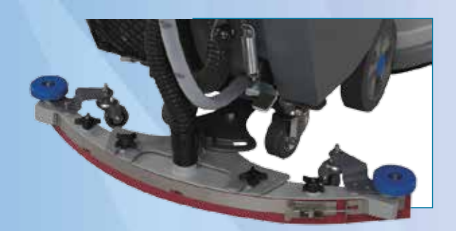
DIE-CAST ALUMINUM CURVED SQUEEGEE